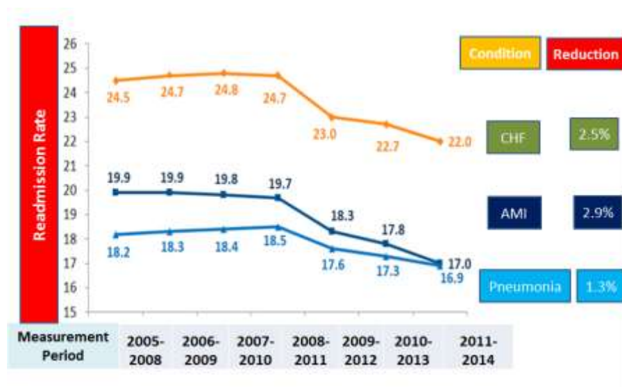
Table 7 - Readmission Rates for the Top Three Conditions

MedPAC’s June 2013 Report to Congress indicated that, at a national level, all-cause readmissions for the three reported conditions had a larger decrease in readmissions over the three-year measurement period than for all conditions, suggesting a strong connection between public reporting and implementation of the HRRP. The results tell a compelling story that underlies the adage that, “what gets measured gets attention.” But nonetheless, despite the decrease, the readmission rates remain stubbornly high.